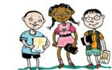
GOD'S ALL STARS (GAS)