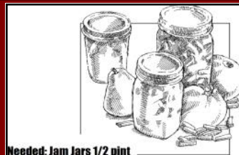
Needed: Jam Jars 1/2 pint

If we have missed your celebration, we apologize. Please let us know by contacting the church office by email: sob580@sbcglobal.net or by telephone.