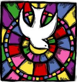
Luther's Small Catechism

On Wednesday, January 26 the Adult group began its big push before Lent begins and the Faith & Fellowship hiatus, with a study of Luther's Small Catechism. Luther developed the Catechism as a faith teaching tool for the home. He envisioned parents and children together learning the core elements of our faith. We will examine each of his main sections: the Ten Commandments, the Lord's Prayer, the Apostles' Creed, Baptism and Holy Communion. If you did miss the first session, don't worry you can catch up easily. See you in the Big Room at 6:05 p.m. for our study. Of course, you are most welcome to join us for dinner at 5:30 p.m. as well.